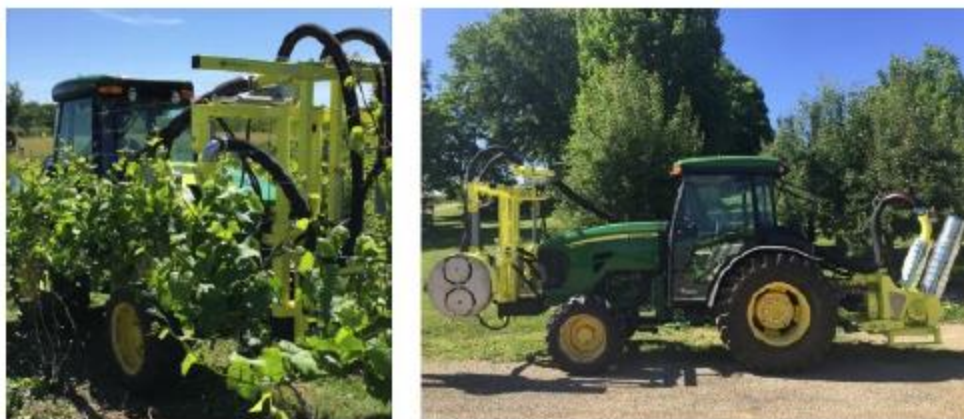
Figure 2.5 Left: whole view of the leaf remover; Right: the machine shattering leaf between two rows.

Experimental vines were set up in three blocks, with three replicate sub-blocks for each treatment. Within each replicate block, nine vines were tagged for experiment with extra two vines as guard vines (one on each block end). In addition, three target vines were randomly selected in each block and three target shoots were randomly tagged in each target vine to keep track for the detailed measurements of weekly shoot length, fruit set percentage, cluster parameters, and fruit chemistry. In summary, each treatment had nine experiment vines (including three tagged vines) each with 3 tagged shoots.