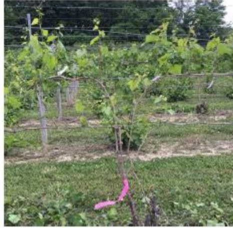
Figure 2.1 Pre-bloom manual leaf removal (PB Man) treatment. Left: before application; Right: after application.