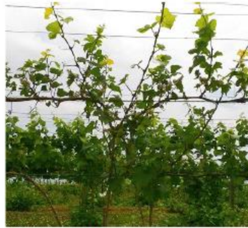
Figure 2.2 Pre-bloom mechanical leaf removal treatment (PB Mec). Left: before application; Right: after application.

Mechanical treatment was carried out by a leaf remover named Collard E2200F (Collard, Bouzy, France, Figure 2.5). The machine releases relatively low pressure air pulse from two to four nozzles of each rotating wheel, positioned on two axes (40 cm each) per side. Unlike manual leaf removal with detaching each single leaf, the machine reduces the leaf area by shredding the flexible portion of the leaf into pieces on approximately 60 to 80 cm of canopy, leaving the rachis and small pieces of the basal portion of the leaf. On the mechanical treatment rows, the tractor ran at 1.6 km/h, pulsing air at 0.8 bar from two nozzles (one positioned for the upper cordon while the other for the lower cordon), rotating at 1650 rpm, thus shattering leaves on that 65 cm of canopy which correspond to the six to eight basal leaves of the shoots both on the upper and lower cordon.